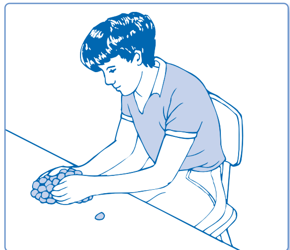
▲ Figure 5-1. How many Moons would fit into Earth?

Some teams may use almost all of the balls for their model, which is about right. If 50 clay balls are used, the clay model Earth should be about the same size as the large foam ball Earth. The exact number of clay balls used will vary depending on the size of each of the balls. If no one was close to being right, have teams add to their models until at least one team is close.