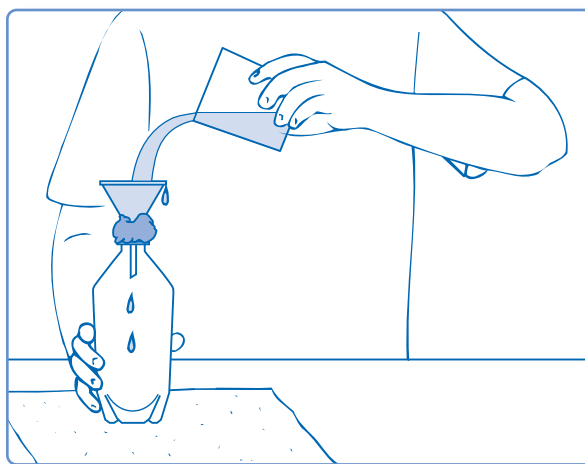
▲ Figure 3-1. Pouring water into the funnel.