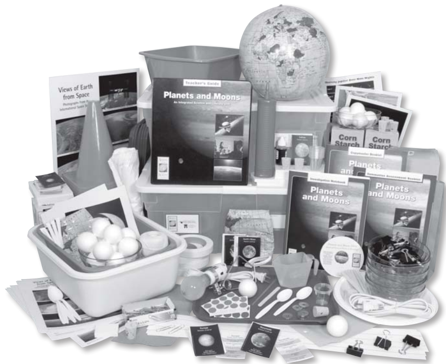
Planets and Moons Science and Literacy Kit