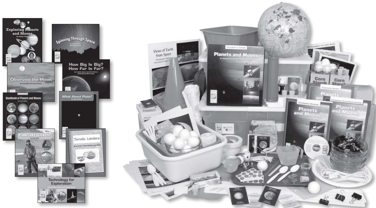
Planets and Moons Science and Literacy Kit

To learn more about Seeds of Science/Roots of Reading ® products, pricing, and purchasing information, visit www.deltaeducation.com