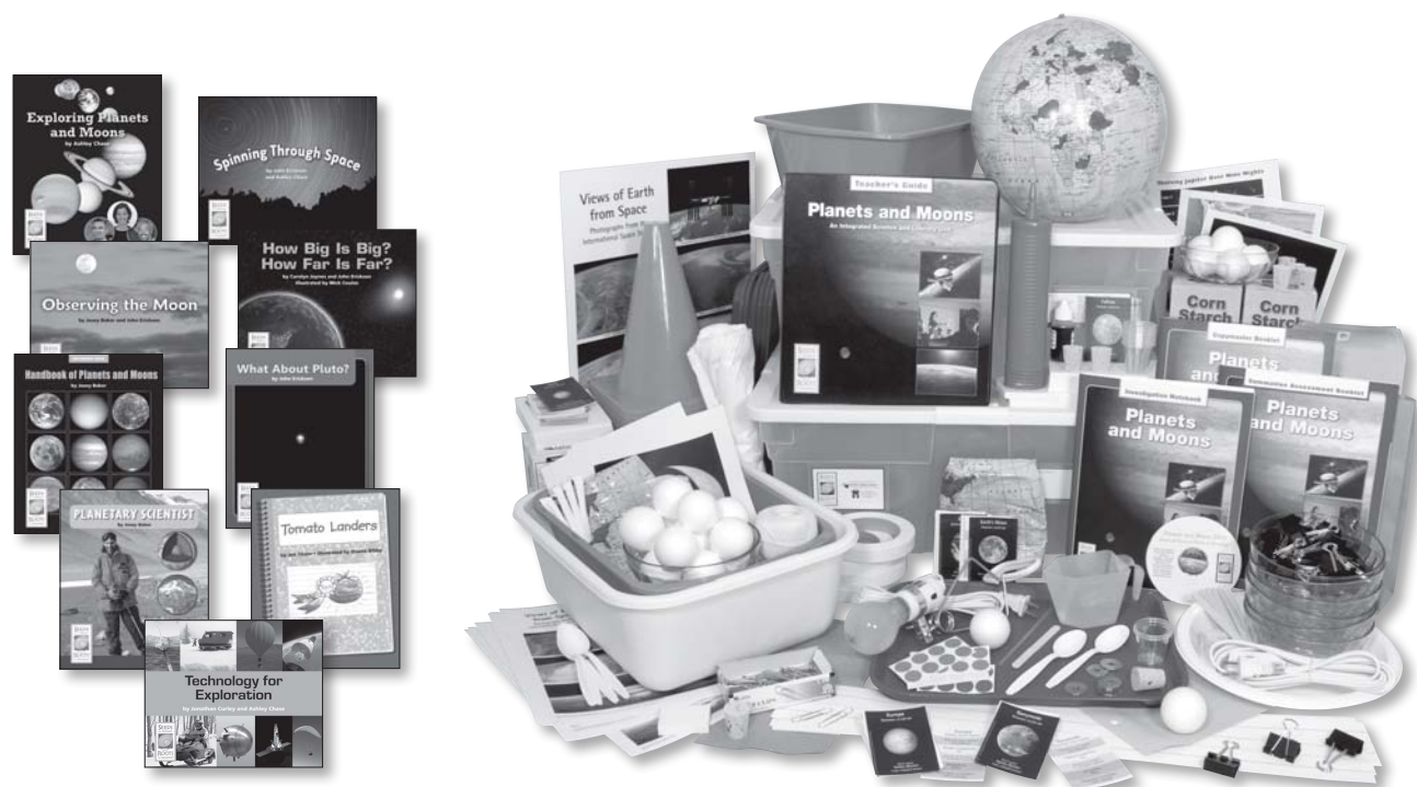
Planets and Moons Science and Literacy Kit

To learn more about Seeds of Science/Roots of Reading ® products, pricing, and purchasing information, visit www.deltaeducation.com